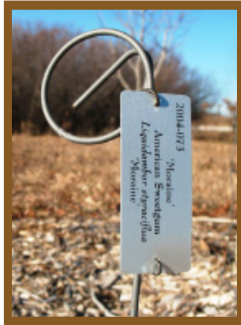
Accession number 97-158 indicates that this tree was the 158th tree planted in 1997.

If you find a tree without a tag, please let us know. Most of the tree and shrub collections are planted informally in groups of the same species, allowing you to compare similar trees.