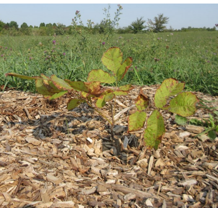
New mockernut hickory

As the trees grow and our landscape design matures, fascinating little spaces are created. One of these is north of the Administration Building in the collection of common baldcypress, Taxodium distichum . The sense of being in this space is so strong as I stand amongst these young but stately trees. It's peaceful and relaxing to hear the breeze blow through their feather soft foliage. The five upright Shawnee Brave® Common Baldcypress, Taxodium distichum 'Mickelson', stand like gentle guards watching over all visitors to this place.