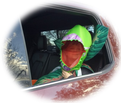
Mystical Forest: A Haunted Drive-Through October 31; 2 to 5 pm

The ongoing pandemic hasn't stopped us from having lots of fun and educational classes this year. Mark your calendar for these events as we wrap up 2021.