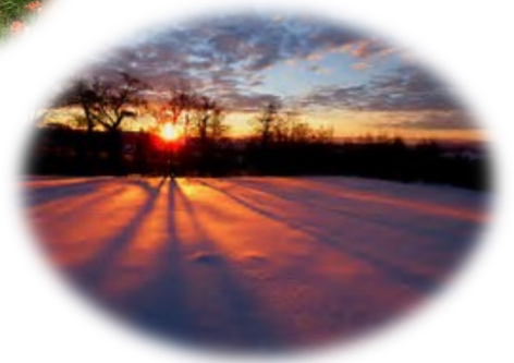
Light the Night December 21; 5:30 to 7:30 pm

Register for our classes at: www.thebrentonarboratum.org