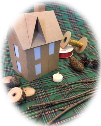
Curbside Craft Kit: Gingerbread Houses December 4; Pick up between Noon and 2 pm