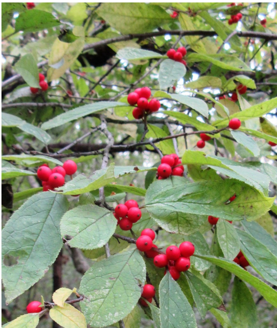
Winterberry in fruit

The mountain maple, Acer spicatum , is a small understory tree that prefers cool moist soils which northeast Iowa, with its