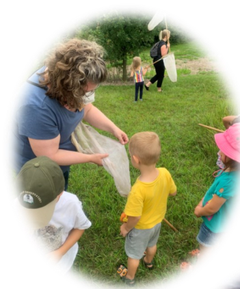
Nature Club & Nature Club PLUS November 4 & November 18; 9 to 10 am & 10:30 to 11:30 am