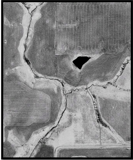
Arboretum in September of 1996

It was a warm fall afternoon and the dust was blowing behind me as I headed west down the gravel road to a destination I had never been to before. I had heard of this place just a week earlier at a Capital Square office in downtown Des Moines. Then I was dressed in a suit and tie but today I was dressed in blue jeans and work boots. I was following a white Ford Taurus wagon with a dog in the back. I followed the white car into the driveway to get my first glimpse of a few very small trees