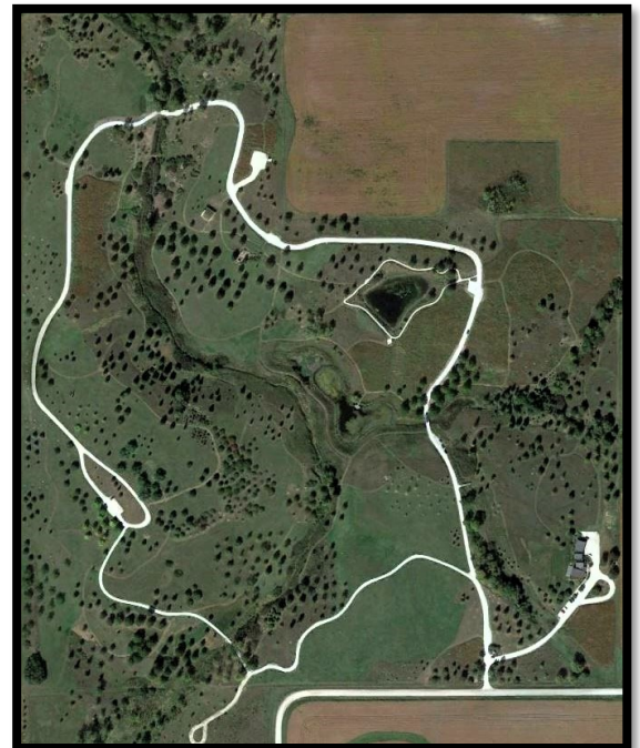
Arboretum in September of 2021

Much has changed in the last 25 years since I started at the arboretum especially when it comes to the reason we exist, the trees. Trees which have been nurtured and with time have created an arboretum. Anyone driving west down the gravel road now knows they have arrived at the Brenton Arboretum. So, if its been awhile since you were out for a visit or if it was just last week, come and see for yourself how the trees have grown and the beautiful space they have created.